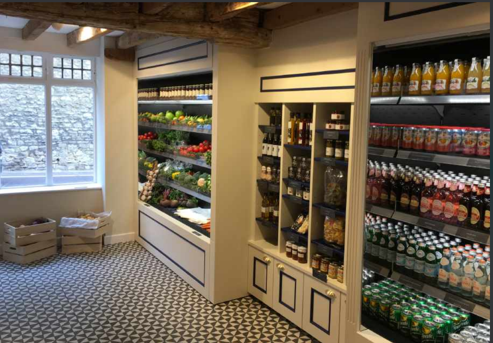
Smith & Clay, Buckingham