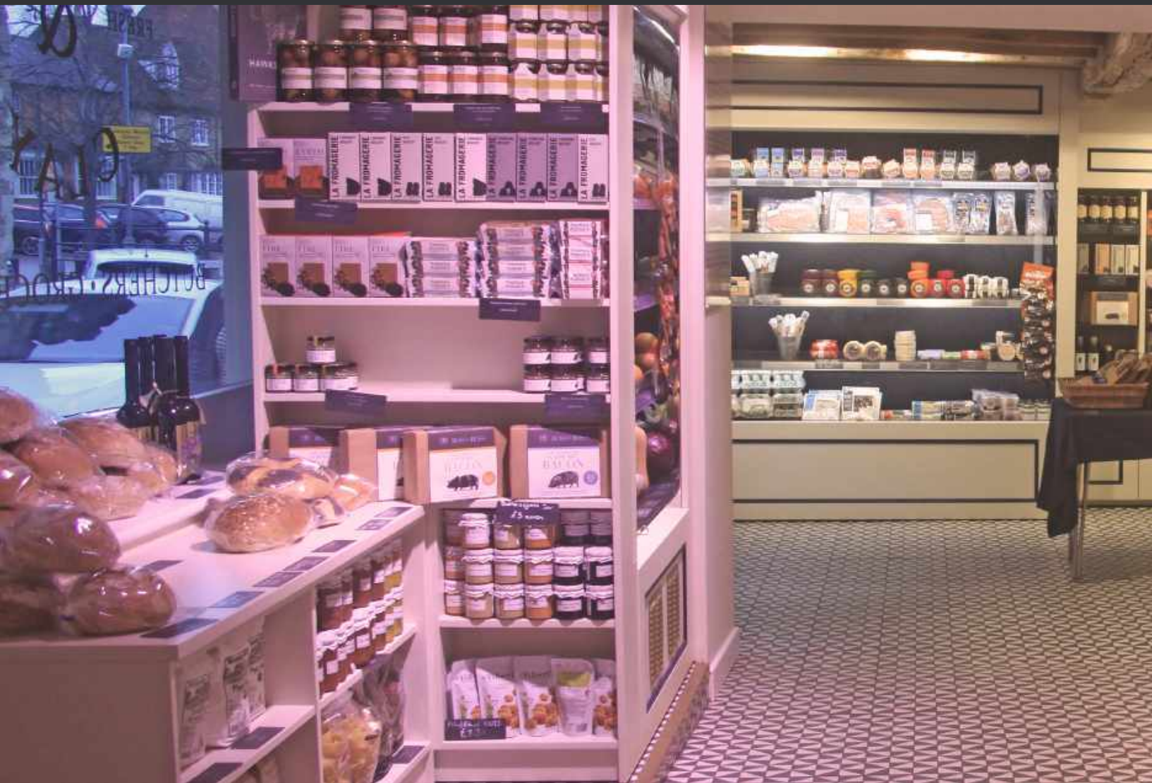
Smith & Clay, Buckingham