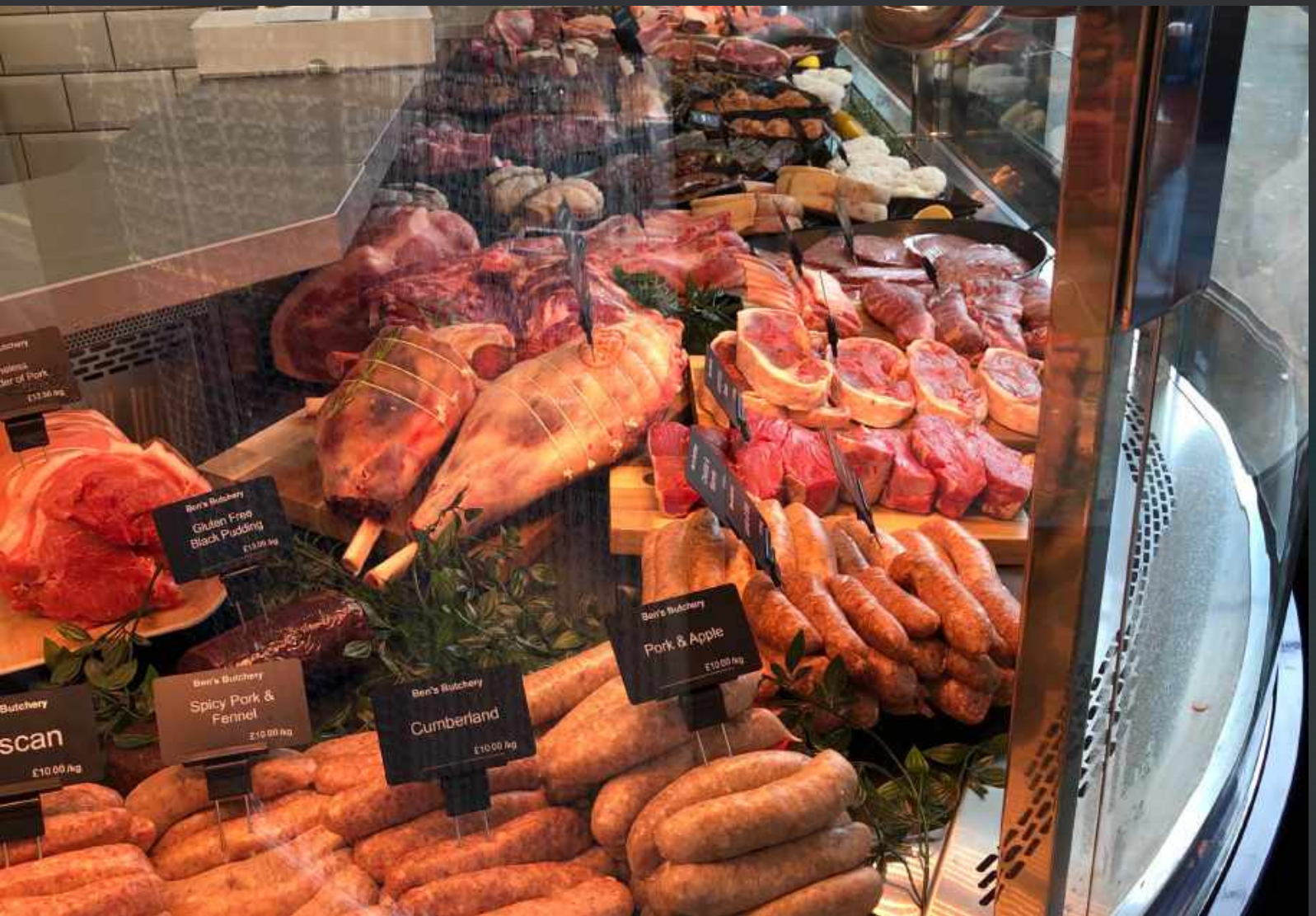
This Page: Ben's Butchery Opposite Page: Millets Farm Centre Last Page: Cowdray Park Farm Shop