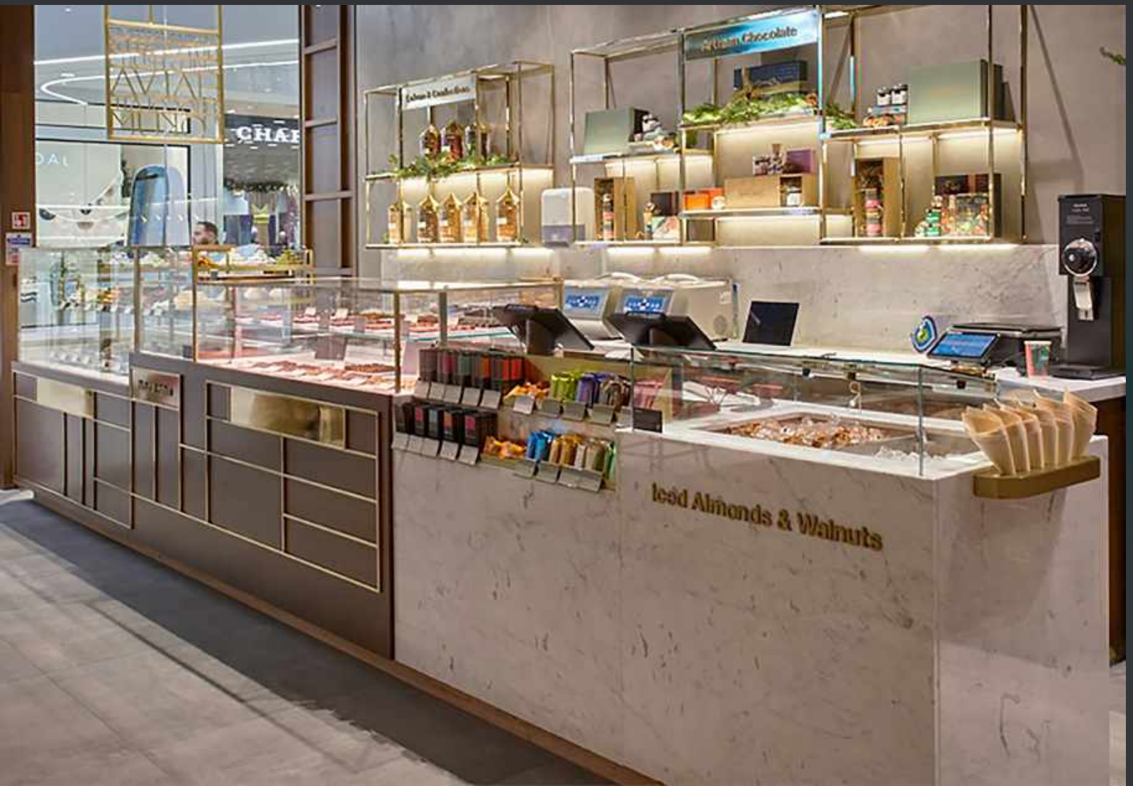
Kernel & Roast, Westfield London