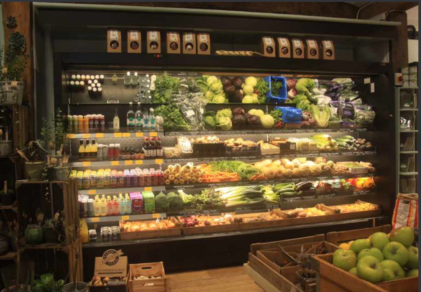
Cowdray Park Farm Shop