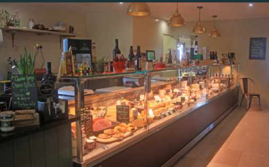
This Page Clockwise from top left: Farndon Fields, Hartley Farm Shop & Leaf and Ground Opposite Page Clockwise from Top: Kernel & Roast, Peggy Porschen & Fortnum & Mason