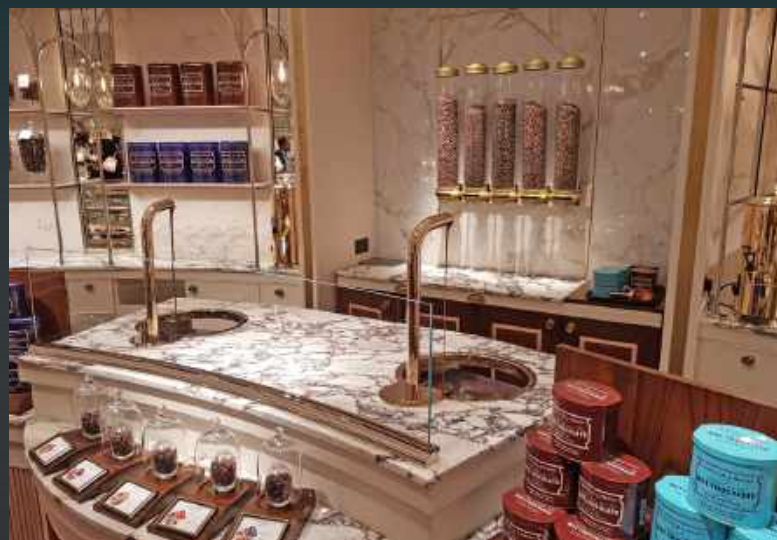
Fortnum & Mason Chocolate Department