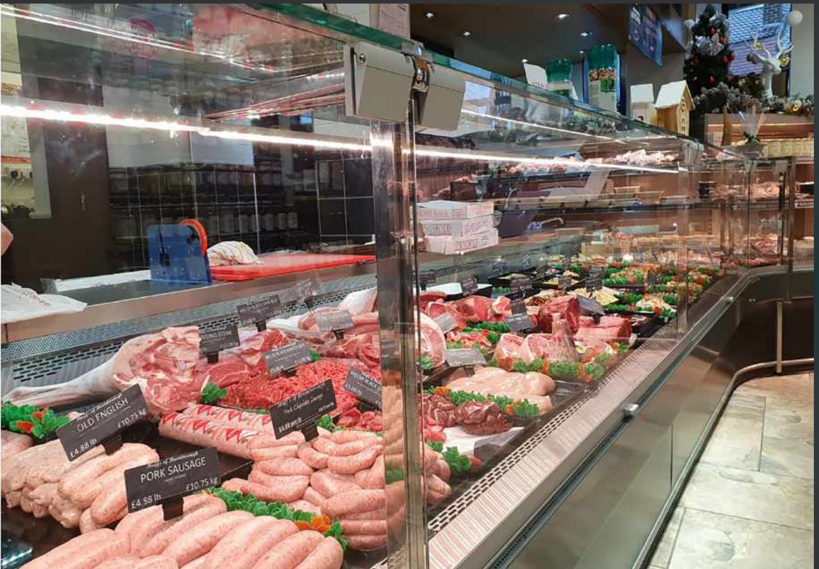
Muffs of Bromborough