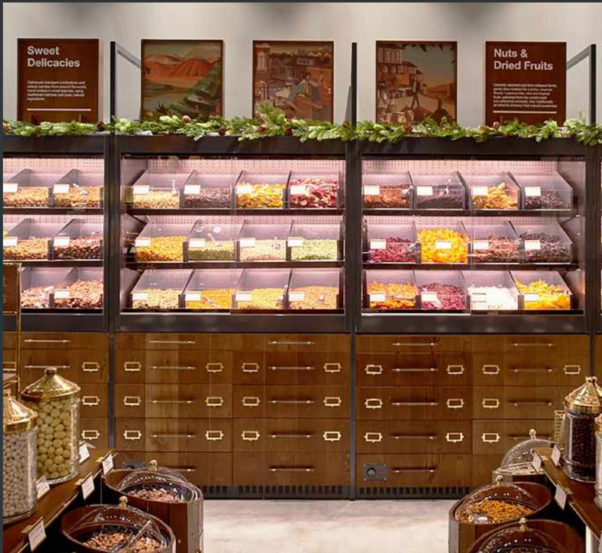
Kernel & Roast, Westfield London