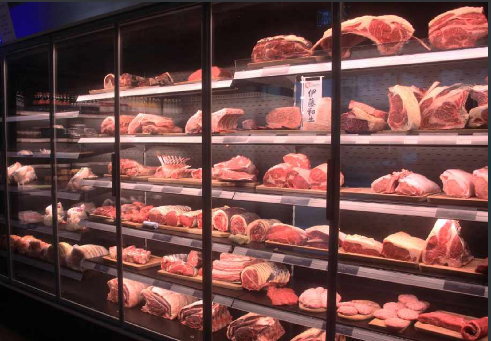
Malloys Craft Butchery