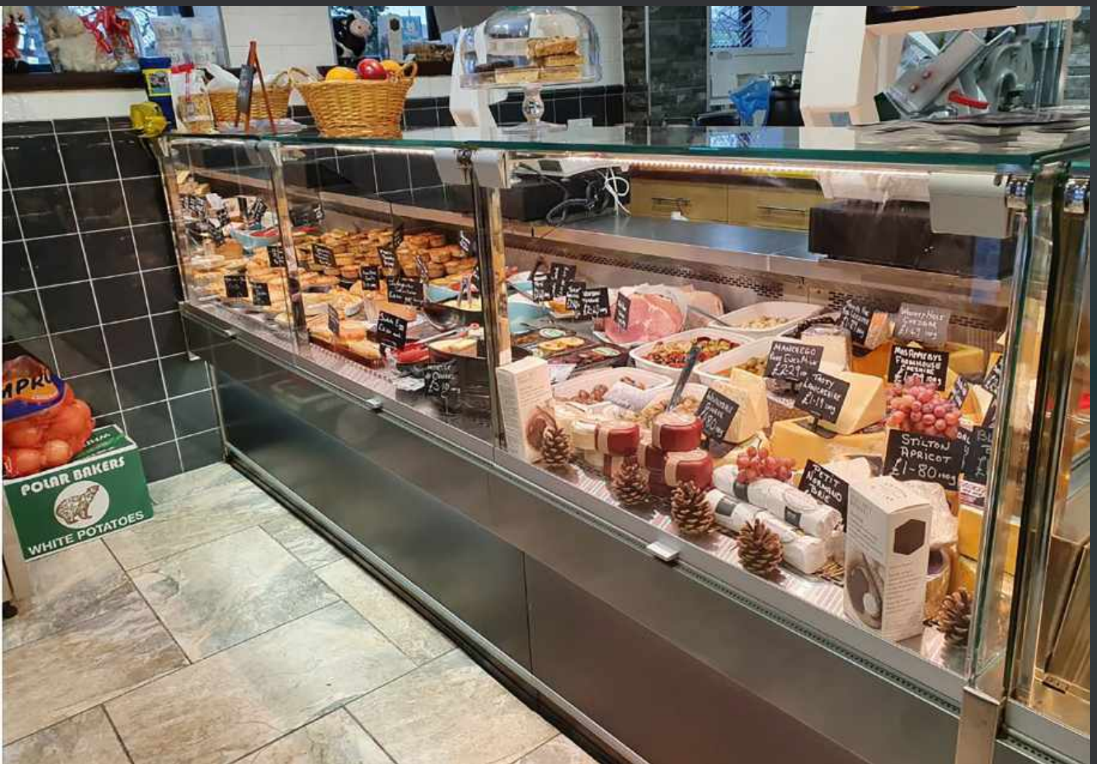
This Page: Muffs of Bromborough Opposite Page Clockwise from top left: Farndon Fields, Jarrolds Food Hall, Smith & Clay & Newlyn's Cheese Room