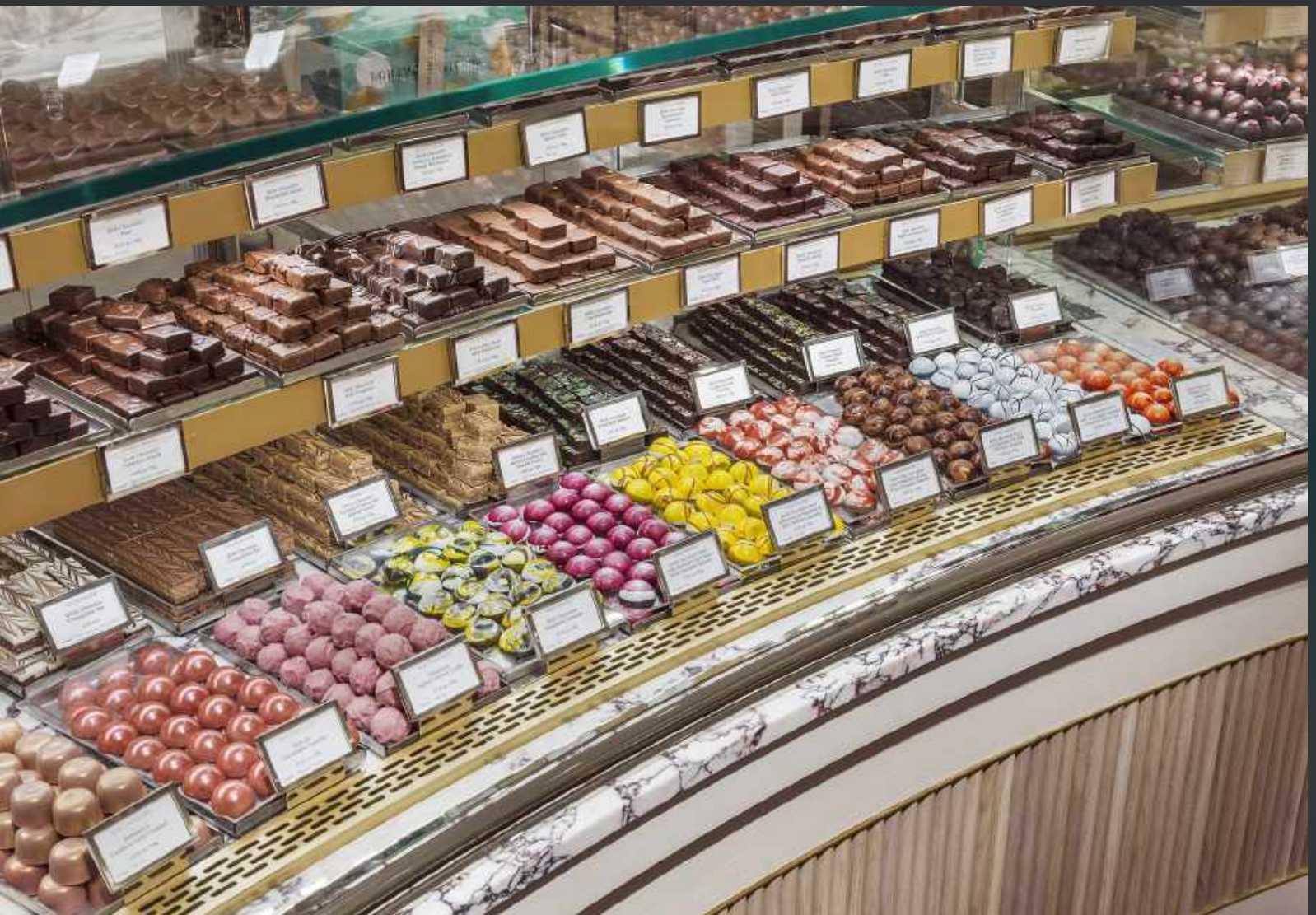
Fortnum & Mason Chocolate Department