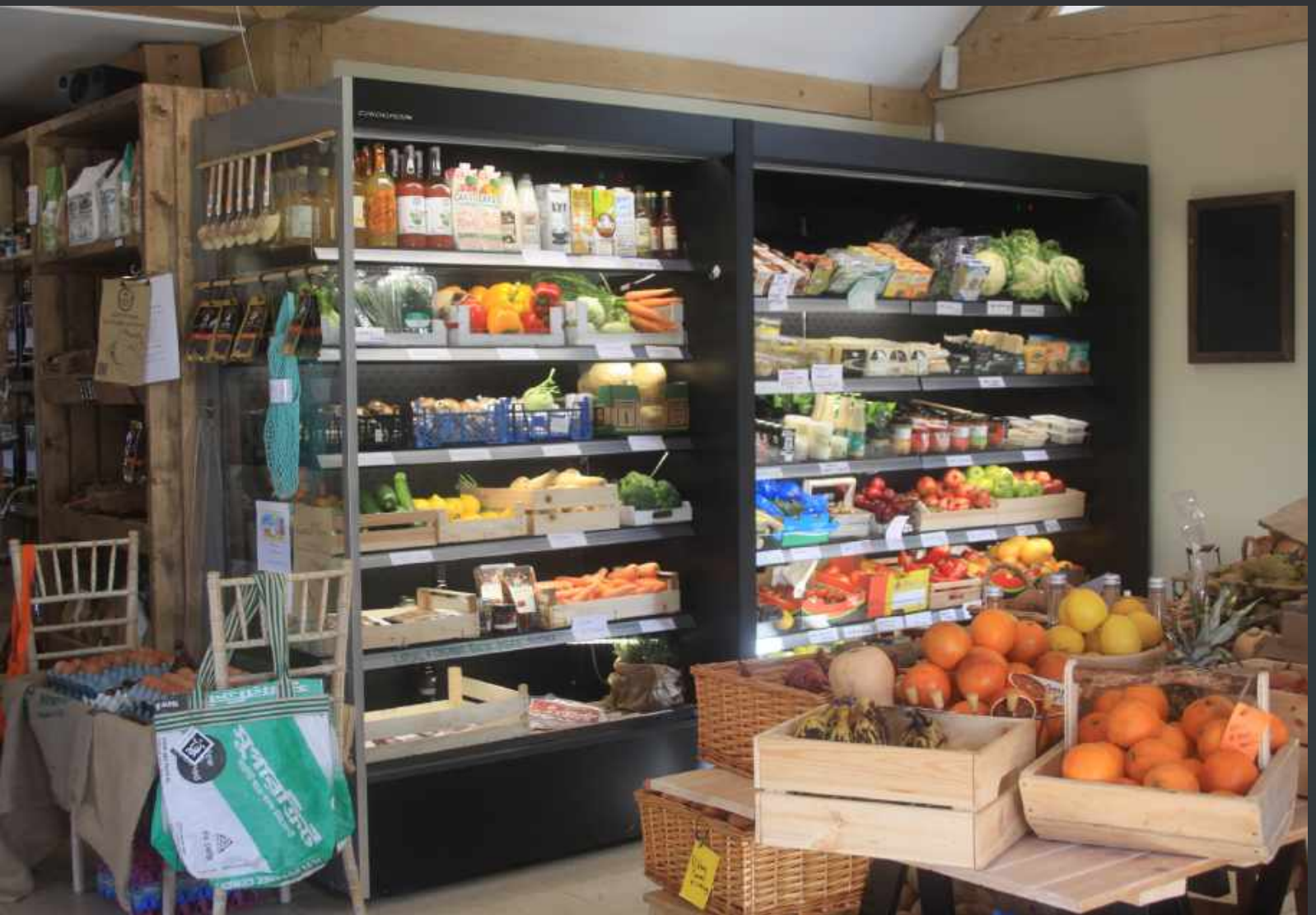
Leaf and Ground