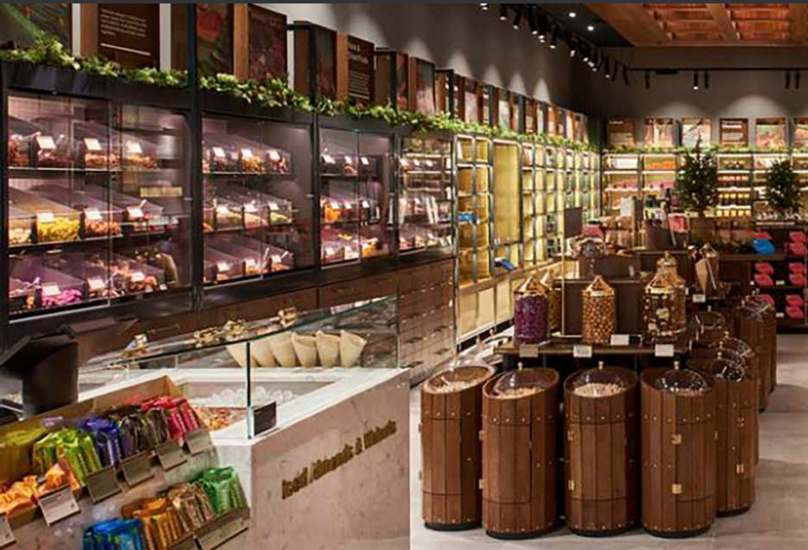
Kernel & Roast, Westfield London