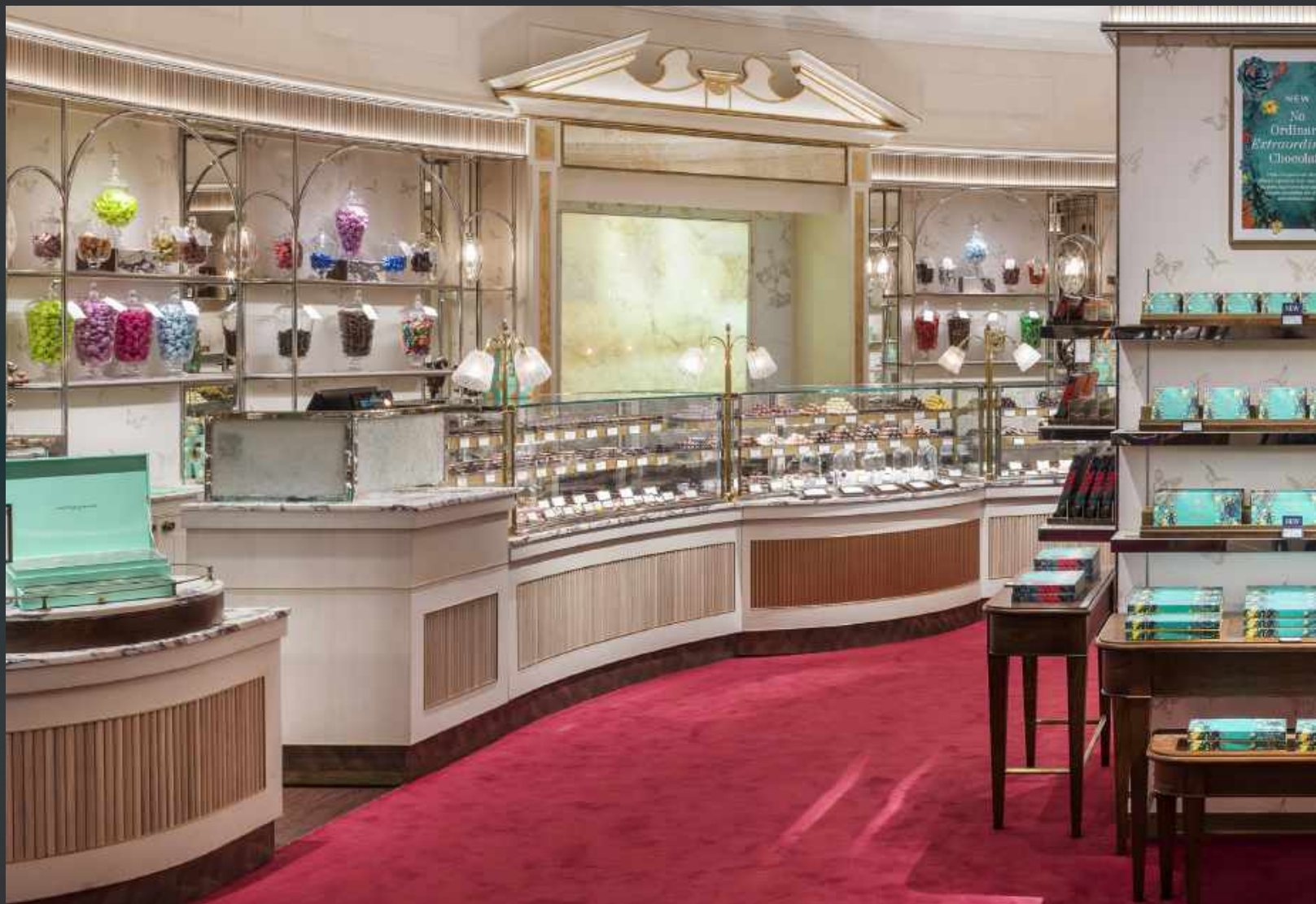
Fortnum & Mason Chocolate Department