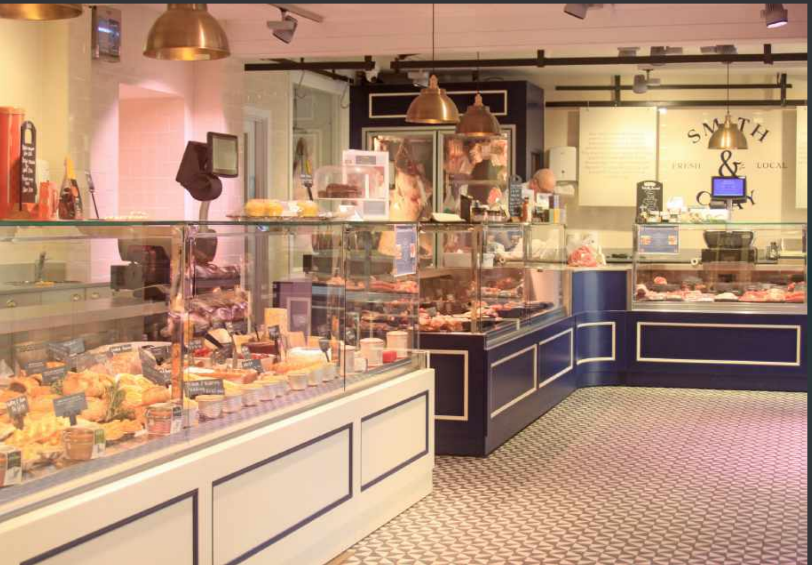
Smith & Clay, Buckingham