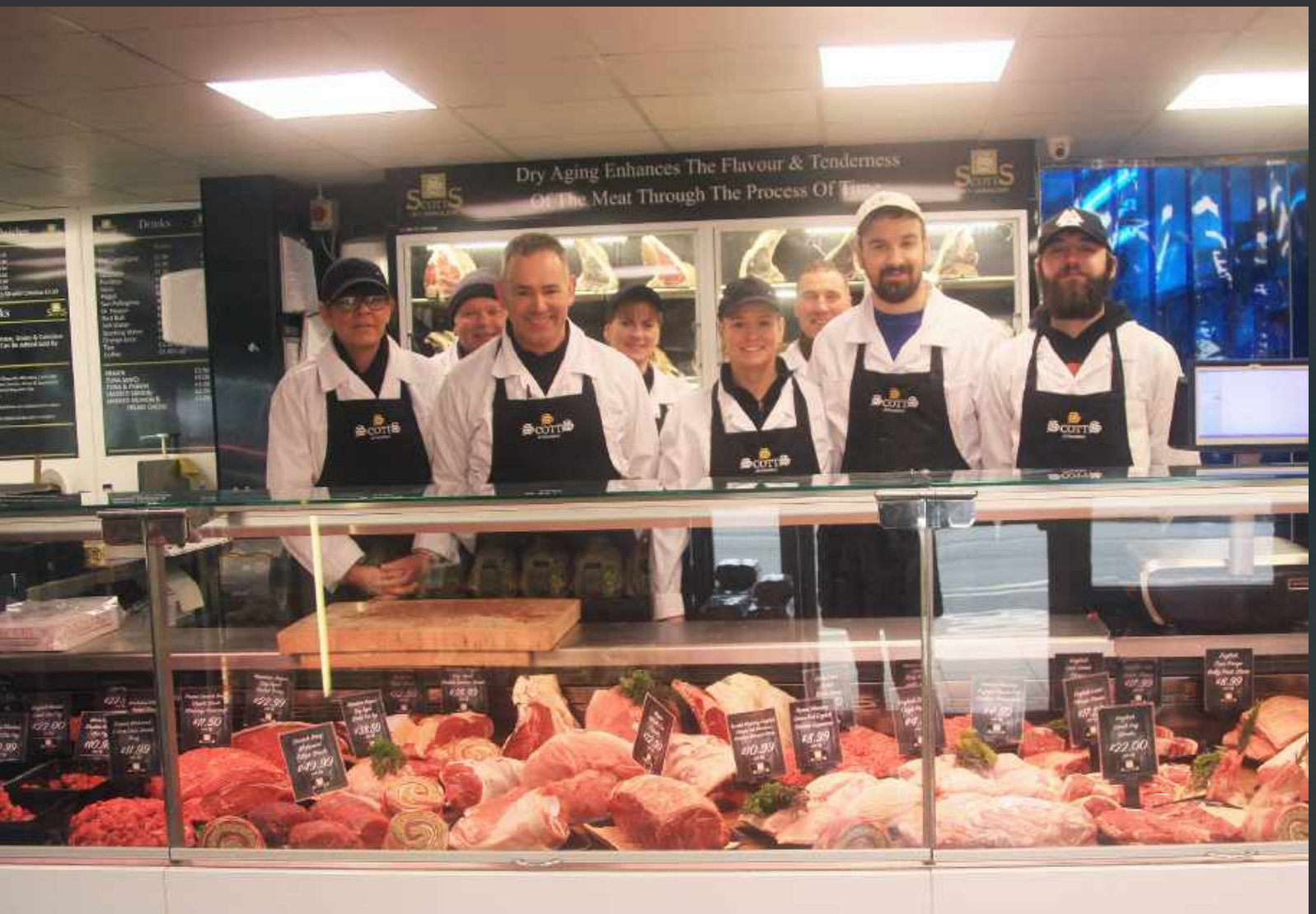
Front Page : Fortnum & Mason Chocolate Department These Pages : Scotts of Carshalton